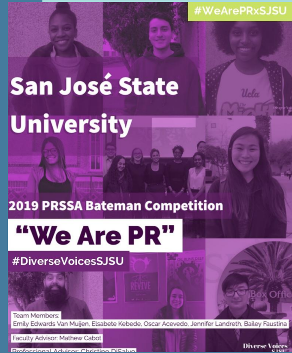
Previous SJSU PRSSA Bateman Competition entry in 2019.